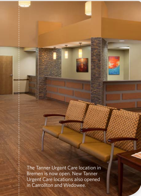
The Tanner Urgent Care location in Bremen is now open. New Tanner Urgent Care locations also opened in Carrollton and Wedowee.

VISITS TO TANNER URGENT CARE LOCATIONS THROUGHOUT THE REGION