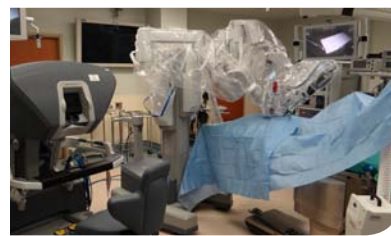
The new da Vinci Si e HD robotic surgery system has come to Tanner Medical Center/Carrollton.

Minimally invasive robotic surgery is now an option for patients at Tanner Medical Center/Carrollton.