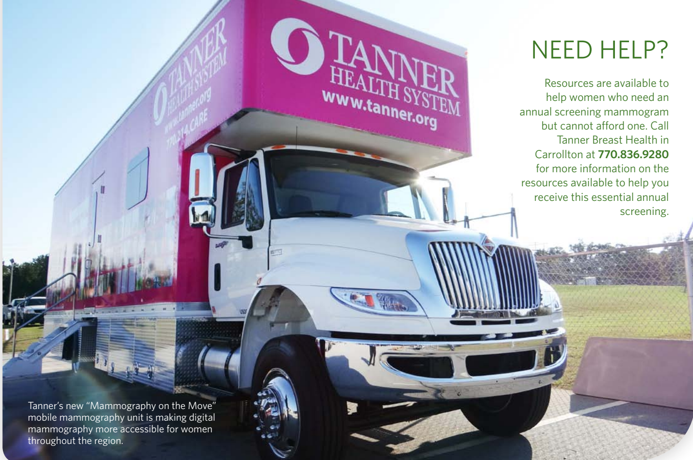
Tanner's new "Mammography on the Move" mobile mammography unit is making digital mammography more accessible for women throughout the region.