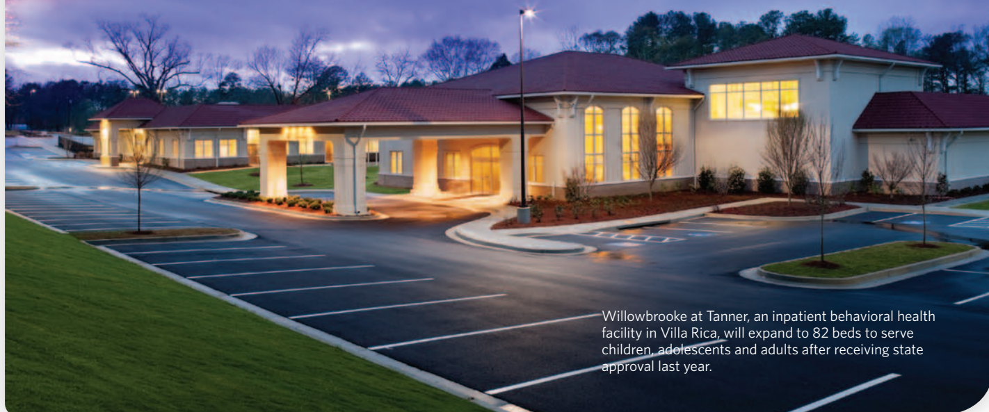
Willowbrooke at Tanner, an inpatient behavioral health facility in Villa Rica, will expand to 82 beds to serve children, adolescents and adults after receiving state approval last year.

More information about Willowbrooke at Tanner's innovative programs is available online at www.WillowbrookeAtTanner.org .