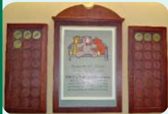
First Impressions footprint gallery at Tanner Medical Center/Villa Rica.

From parents to grandparents to aunts, uncles and employers, the First Impressions program has become a popular gift-giving idea to honor Tanner babies. There are now more than 100 footprint medallions mounted on the wall in the nursery viewing area at TMC/Carrollton. With the opening of the new TMC/Villa Rica in October 2003, the First Impressions Gallery was placed on the wall next to the nursery viewing area.